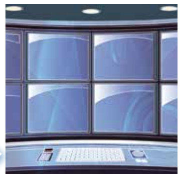
Professional monitoring personnel can review images