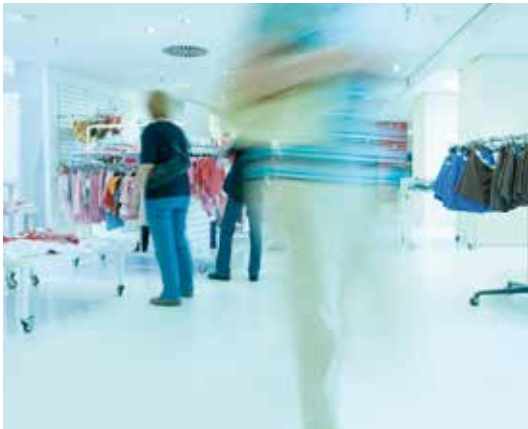
Whenever an incident happens