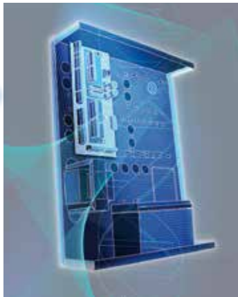
A series of images is sent to the Advisor Advanced control panel