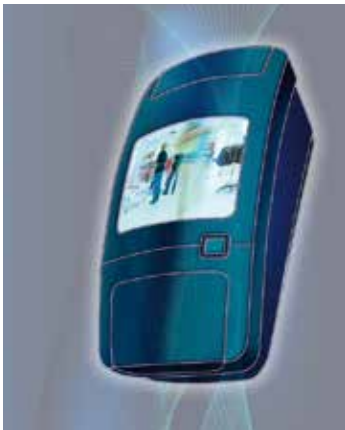
PIRcam takes pictures on the location