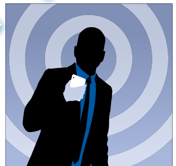
End user is notified